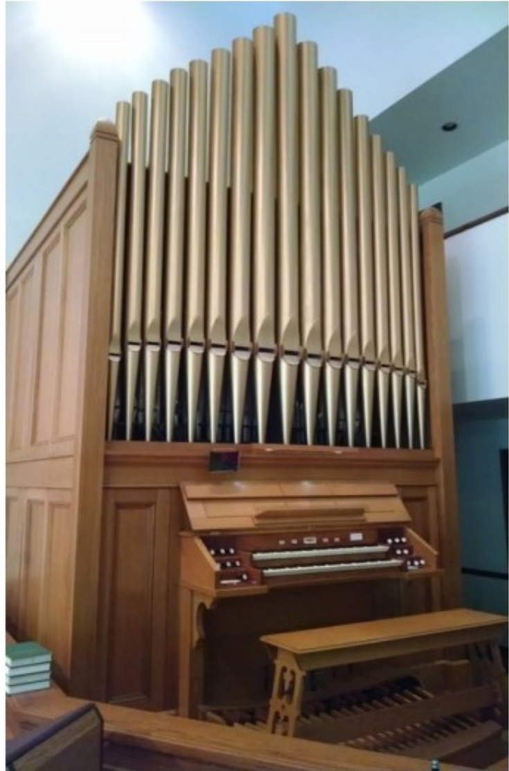
George Kilgen 1907, rebuilt by Roy Redman 1987