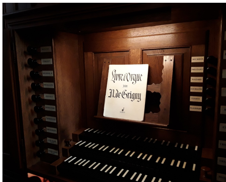
Left: Collégiale St. Thiébaut, Thann