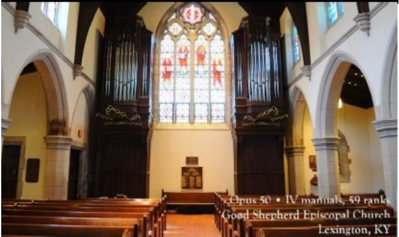
Opus 50 • IV manuals, 59 ranks Good Shepherd Episcopal Church Lexington, KY

New Organs Restorations Additions Service