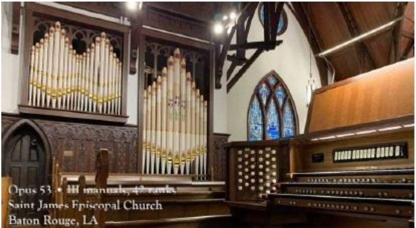
Opus 53 • III manuals, 47 ranks Saint James Episcopal Church Baton Rouge, LA