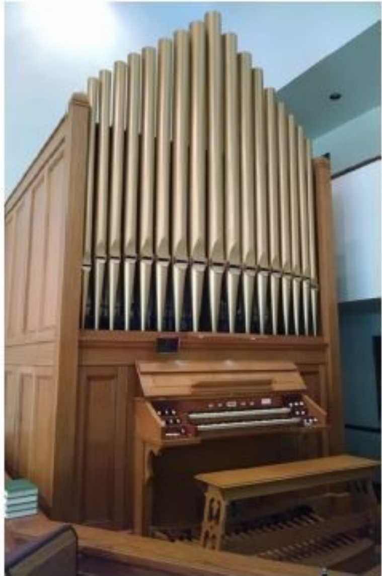
George Kilgen 1907, rebuilt by Roy Redman 1987