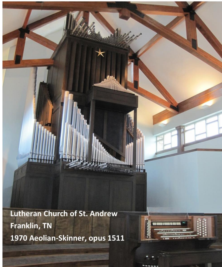
Lutheran Church of St. Andrew Franklin, TN 1970 Aeolian-Skinner, opus 1511

Organ Builders Restorations & Additions Serving the Southeast Since 1968