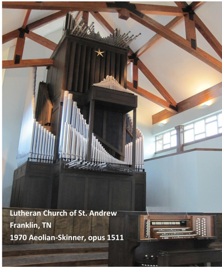
Lutheran Church of St. Andrew Franklin, TN 1970 Aeolian-Skinner, opus 1511

Organ Builders Restorations & Additions Serving the Southeast Since 1968