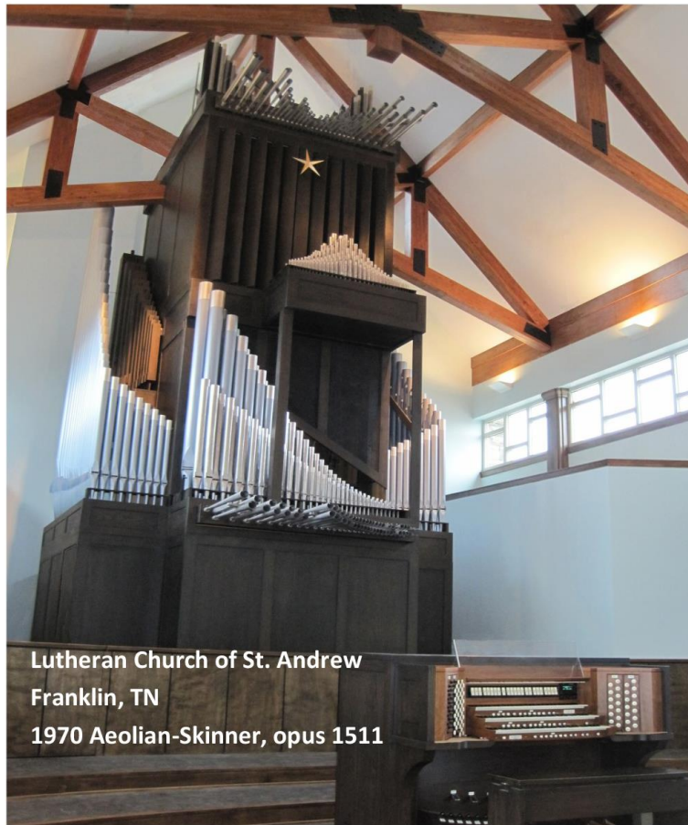
Lutheran Church of St. Andrew Franklin, TN 1970 Aeolian-Skinner, opus 1511

Organ Builders Restorations & Additions Serving the Southeast Since 1968