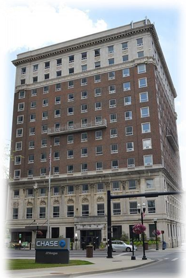
The historic Lafayette Hotel is now serving as City Hall.

Several of our current chapter customs have their roots in decisions made at meetings in the early 1950s. In January, 1952, the Lexington Chapter initiated the tradition of attempting a joint program with the Louisville Chapter. We can't find confirmation that a collaborative event actually came to fruition from those early discussions, but several members did carpool to Louisville for a Virgil Fox concert. In 1953 two changes were officially adopted that continue to the present. At the April meeting, members discussed ways to include choir directors into guild membership, thus expanding the mission of the guild beyond organ music alone. The next month, the chapter voted to have sub-deans automatically move into the office of dean when the current dean's term expires. Though it is no longer automatic, it is a custom that we have often followed through the past half century.