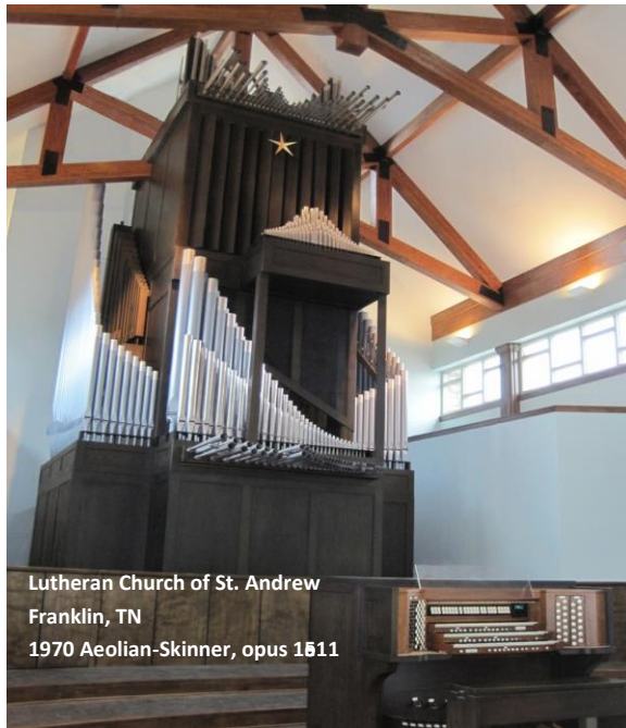
Lutheran Church of St. Andrew Franklin, TN 1970 Aeolian-Skinner, opus 1511

Organ Builders Restorations & Additions Serving the Southeast Since 1968