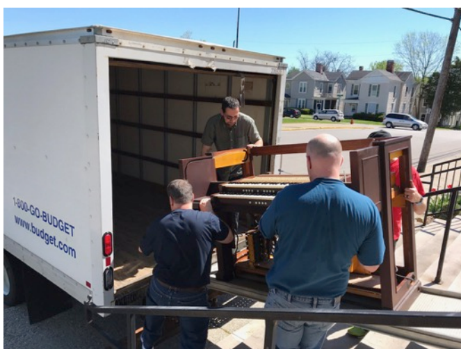
Photos from the recent renovation of the Moller Organ at First Christian Church in Winchester, with work done by D. C. Schroth Organ Builders. Renovations include releathering, revoicing, rebuilding the console, rewiring, and adding wind to the façade pipes to add a rank to the pedal.