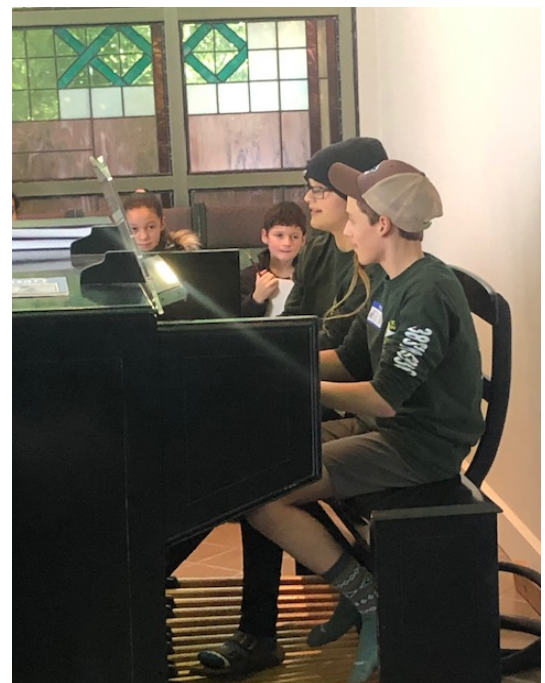
Above: A brother/sister duet in the chapel at First Presbyterian Church