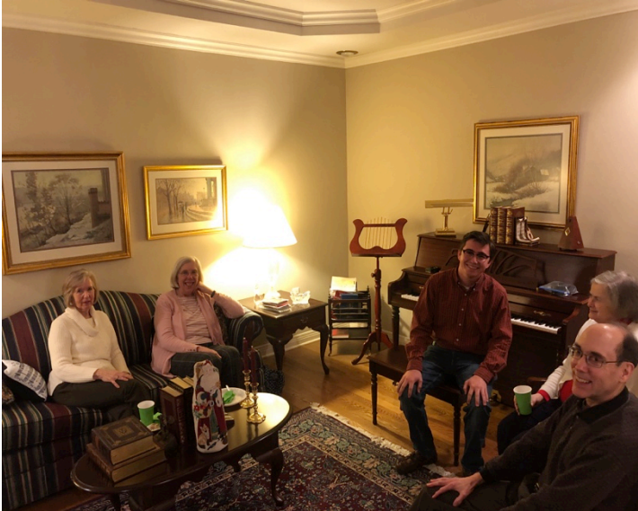
Friends gather in the living room after dinner