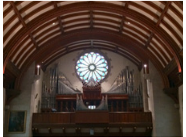
Schantz Organ at St. Catharine of Siena, Cincinnati